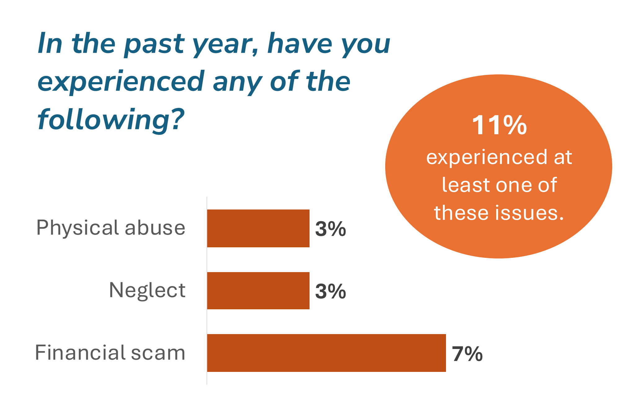
Note: Ns = 2,311 respondents aged 60+.

How might we ensure the safety of all residents, especially those at higher risk?